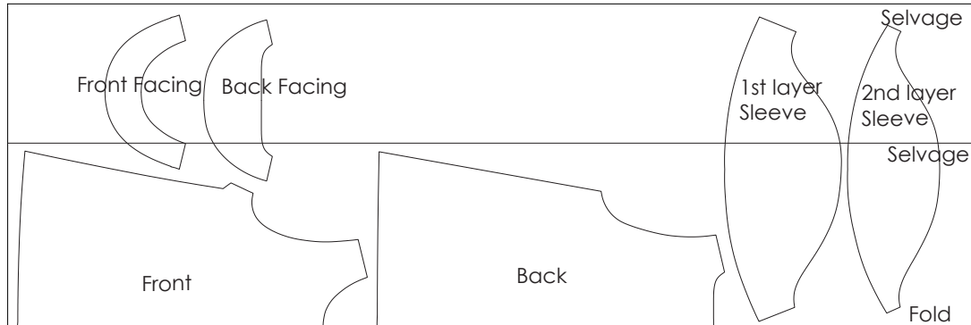
44"-wide fabric suggested cutting layout (XS, S, M, L, XL, XXL)